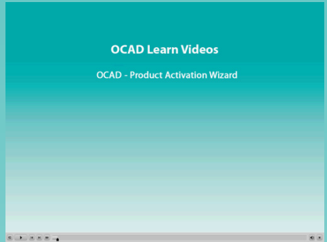
Fig. 1: Learn Videos

Keep OCAD 12 updated! The service updates correct detected errors and are free of charge. You find the latest service updates on our website www.ocad.com/en/downloads